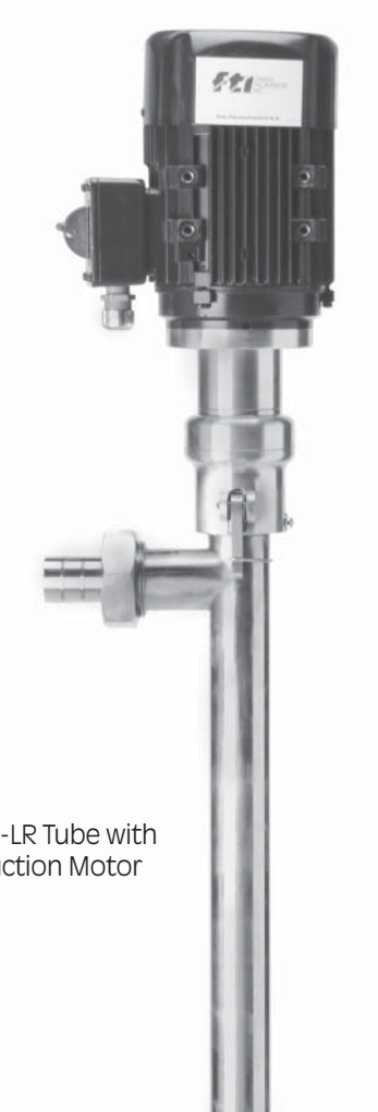
HVDP-LR Tube with Induction Motor