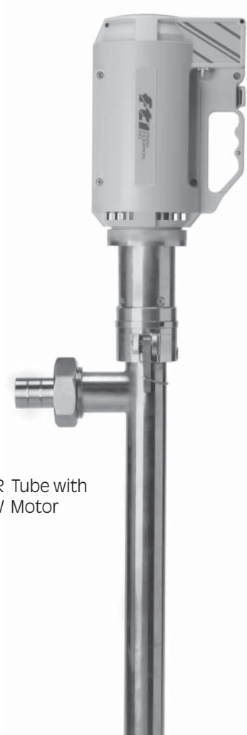
HVDP-HR Tube with 800W Motor